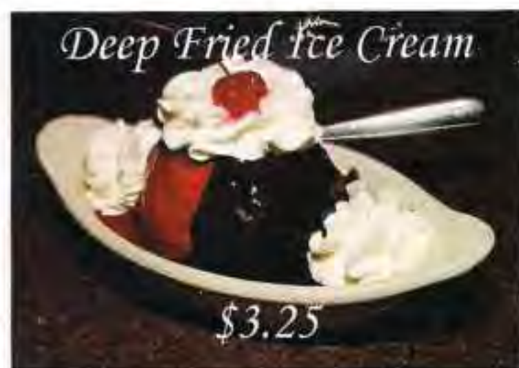
Deep Fried Ice Cream