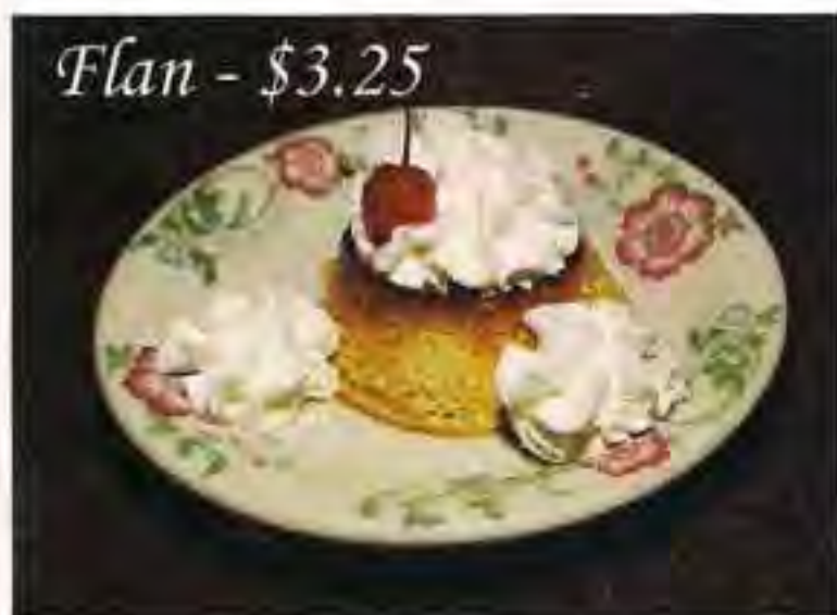
Flan - $3.25